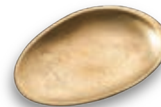
Abalone shell matte JPY9,900 (tax included) Size: W157 x D111xH17mm, Weight: 437g Material: Brass Surface Treatment: Wheel brushing finish