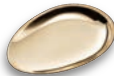
Abalone shell JPY13,200 (tax included) Size: W157 x D111xH17mm, Weight: 437g Material: Brass Surface Treatment: Polishing finish