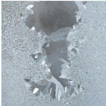
item No. Crystal-103-SOJ size W300×H300mm t1 ~ 1.2mm weight 790g material tin retail price ¥36,000