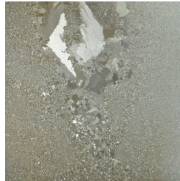
item No. Crystal-103-GTI size W300×H300mm t1 ~ 1.2mm weight 790g material tin retail price ¥41,000